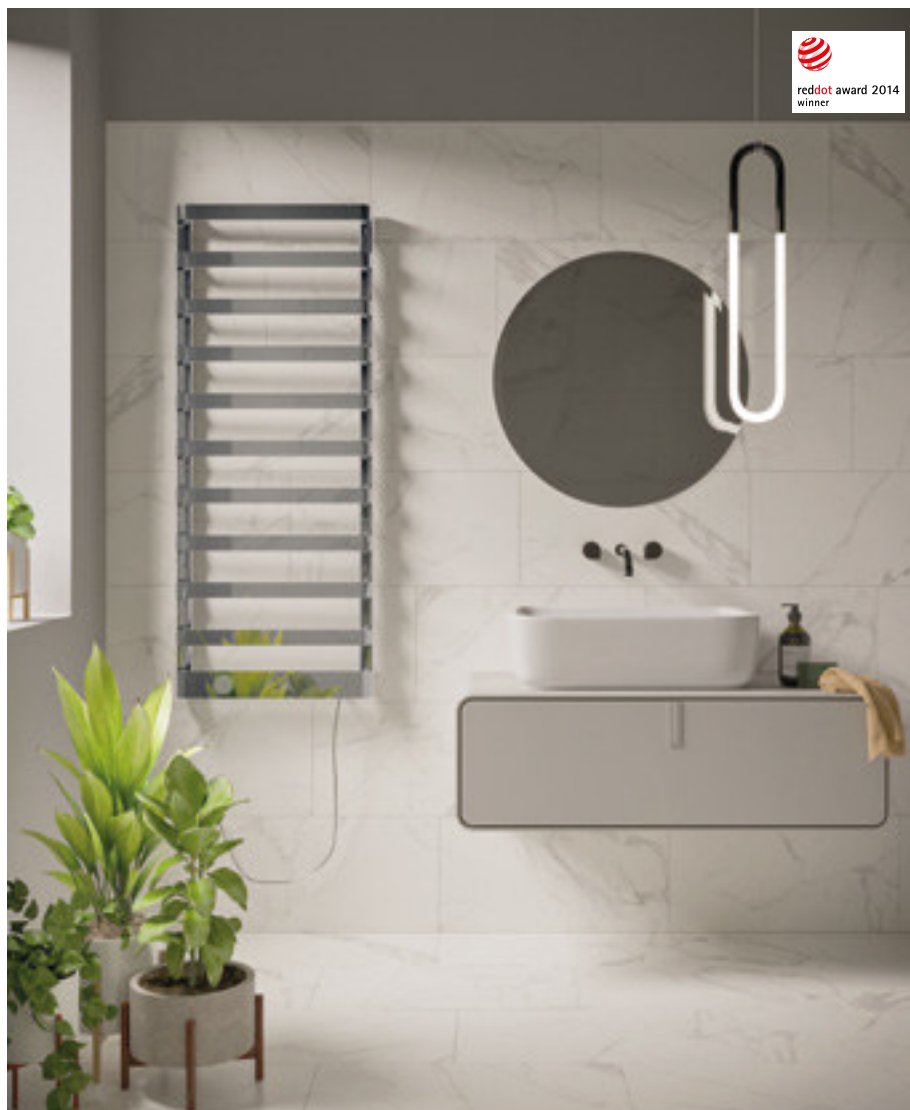
height 1735 mm, length 500 mm. Chrome-plated finish (cod. 50). Designed by Antonio Citterio with Sergio Brioschi

The STEP_E radiator is available in 3 models of dimensions and powers designed to guarantee the best comfort in the bathroom. Ideal not only as a primary source of heat but also as an integration of radiation systems, and for second homes, where a heating system is not always present.